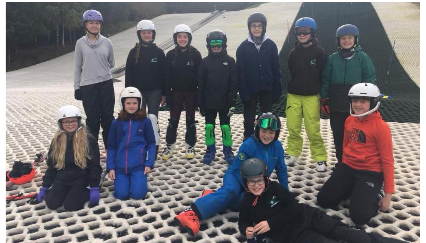
Inverurie Academy Ski Team

On Sunday the 3rd of October, a ski race called the SSSA 2021 autumn dual slalom race took place at Alford dry slope. Our school Inverurie Academy's team took part and two of our teams won medals.