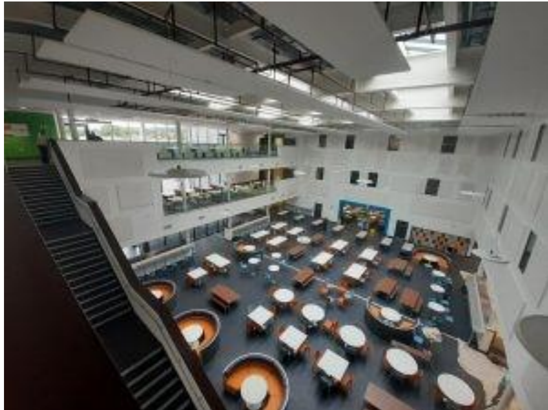
Inverurie Community Campus' new dining area

In the last couple of weeks we got to know the student body, asking them various different questions to help us know them better. From the select few who were questioned there were a variety of different answers to give a better understanding of each year group.