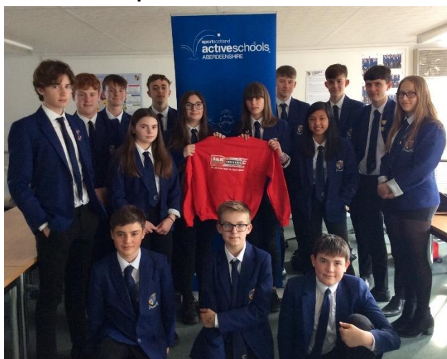
Leaders in Sport 2019-2020